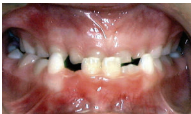
Complete Class III